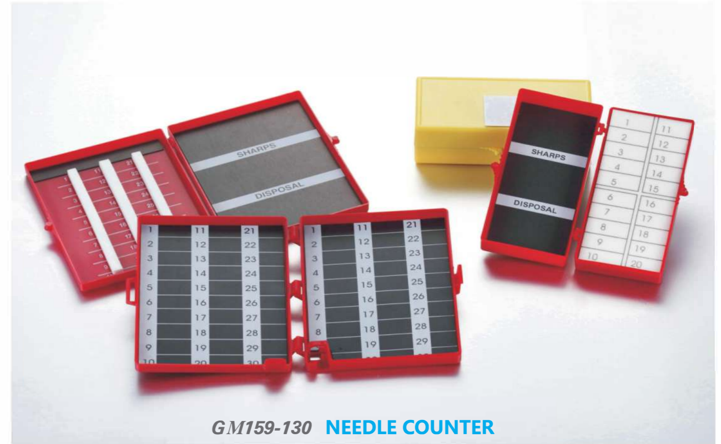
GM159-130 NEEDLE COUNTER