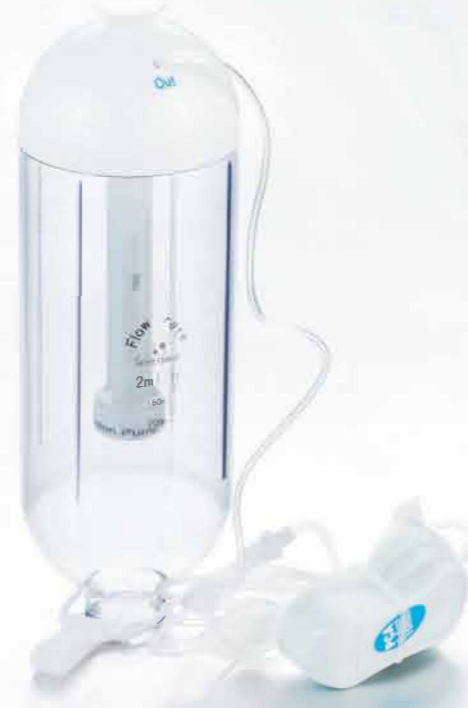
GM034-300B PCA Self-control fluid feeding