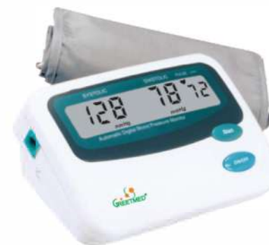
GM001-301 Arm type

Display system: Digital display system/LCD Measuring range: 2.7kpa-40kpa(20mmHg-300mmHg) Accuracy: 0.5kPa(4mmHg) Power source: Type AA batteries*4 for arm type Type AA batteries*2 for wrist type Operating environment: -5°C less than 95RH Automatic power off: To be automatically cut off after few minutes of non use to save energy