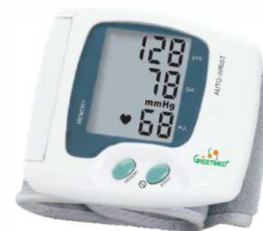
GM001-311 Wrist type