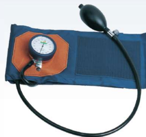
GM001-130 Arm Type Aneroid Sphygmomanometer