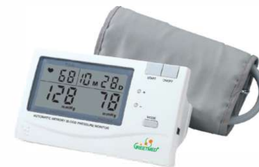
GM001-303 Arm type