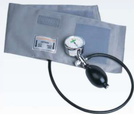
GM001-122 Palm Type Aneroid Sphygmomanometer Metal Shell 50mm Diameter dial