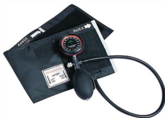
GM001-126 Palm Type Aneroid Sphygmomanometer Plastic Shell 55mm Diameter dial

Best service to all old and new clients! Best greeting to all patients in the world!