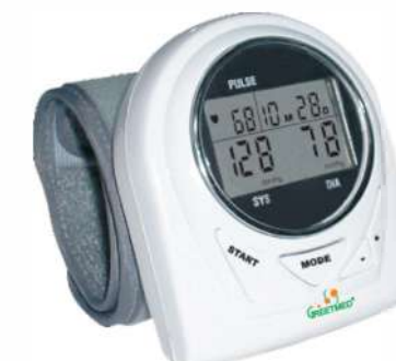
GM001-312 Wrist type