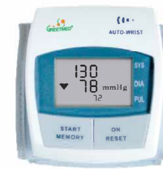
GM001-313 Wrist type