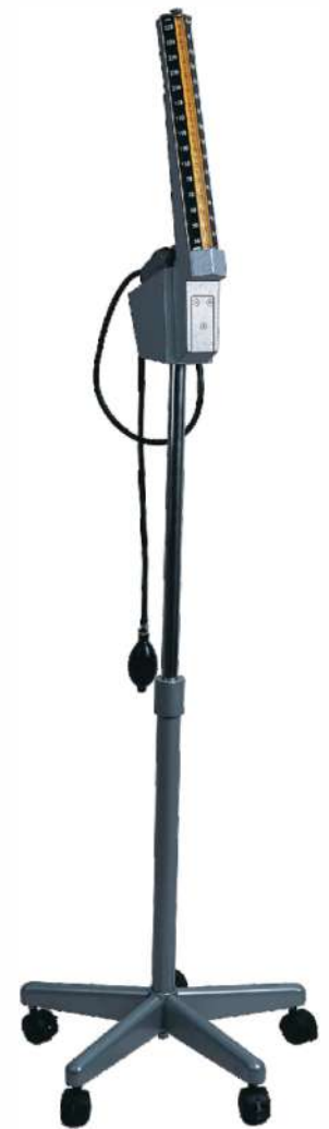
GM001-220 Mercury Sphygmomanometer Floor Type

Best service to all old and new clients! Best greeting to all patients in the world!