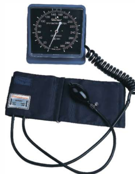
GM001-150 Desk Type Aneroid Sphygmomanometer