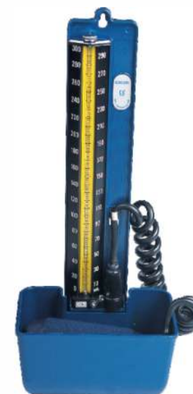
GM001-210 Mercury Sphygmomanometer Wall Type