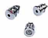
GM001-406 End Valve