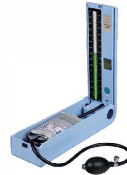
GM001-20 2 Light Display