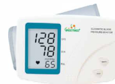
GM001-302 Arm type