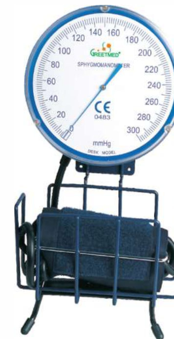
GM001-160 Wall Type Aneroid Sphygmomanometer