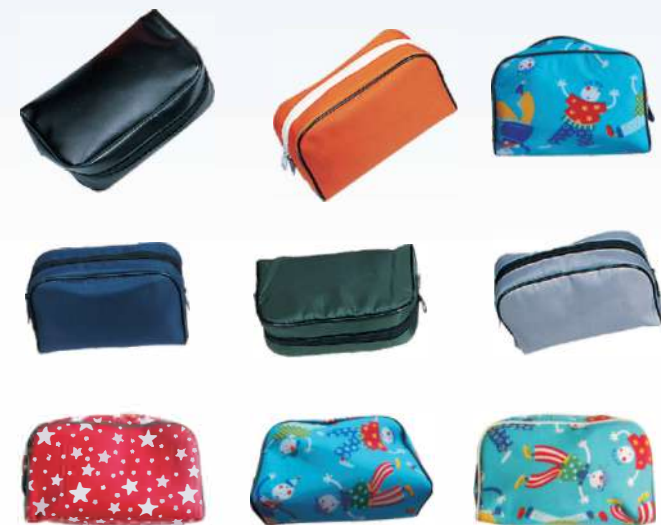
GM001-401 Zipper Case