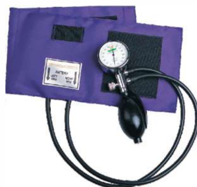
GM001-124 Palm Type Aneroid Sphygmomanometer Metal Shell 50mm Diameter dial