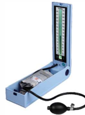
GM001-20 1 LCD Display