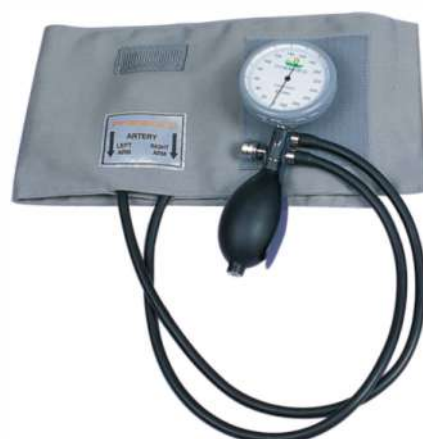
GM001-125 Palm Type Aneroid Sphygmomanometer Plastic Shell 65mm Diameter dial