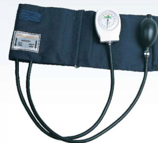
GM001-140 White plastic cover Type Aneroid Sphygmomanometer