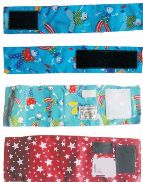
GM001-407 Cuff Material: Nylon or cotton