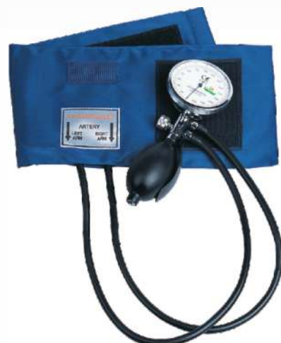
GM001-123 Palm Type Aneroid Sphygmomanometer Metal Shell 65mm Diameter dial