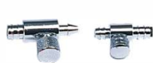
GM001-405 Air-release Valve